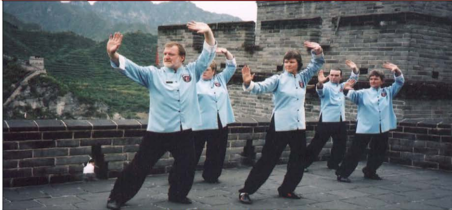
Chi Kung on the Great Wall of China