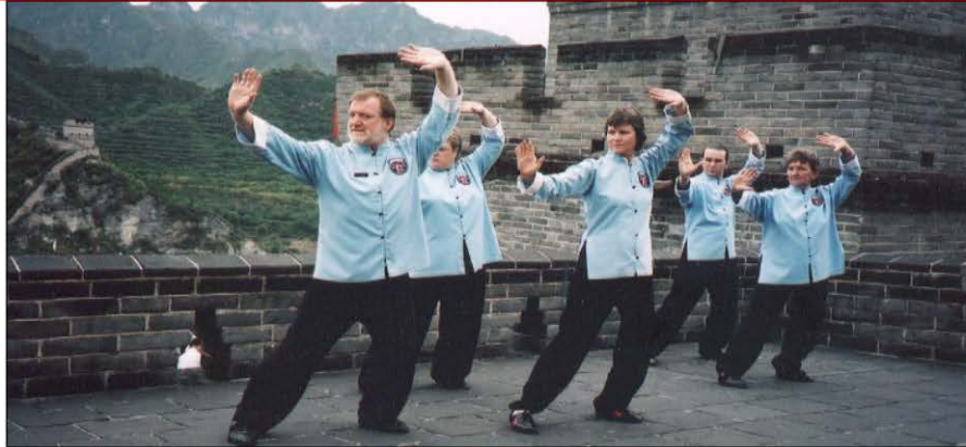
Chi Kung on the Great Wall of China