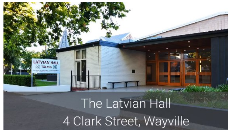
The Latvian Hall 4 Clark Street, Wayville

Adelaide - Wayville Venue Tai Chi & Chi Kung on Tuesdays Chi Kung - 6.15pm or Tai Chi - 7.15pm