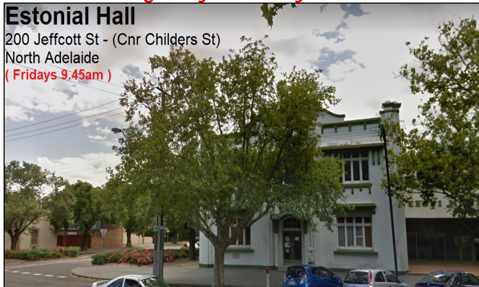
Estonial Hall 200 Jeffcott St - (Cnr Childers St) North Adelaide (Fridays 9.45am)