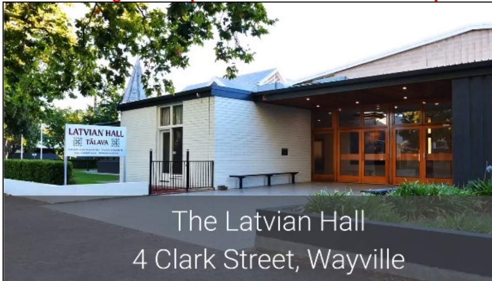
The Latvian Hall 4 Clark Street, Wayville