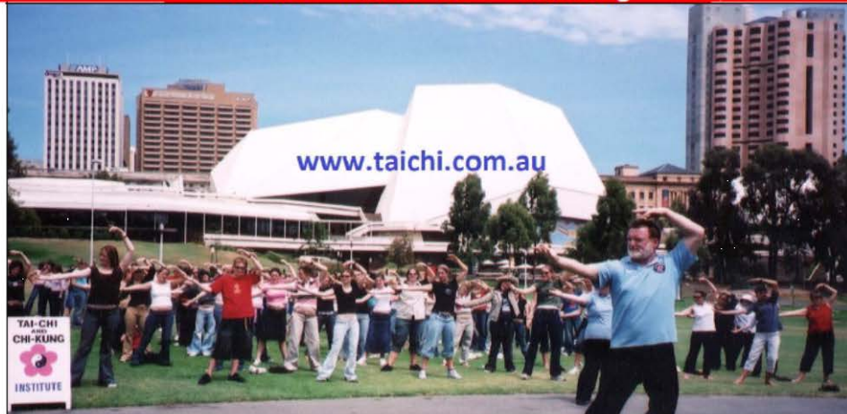
Tai Chi - Chi Kung in Adelaide