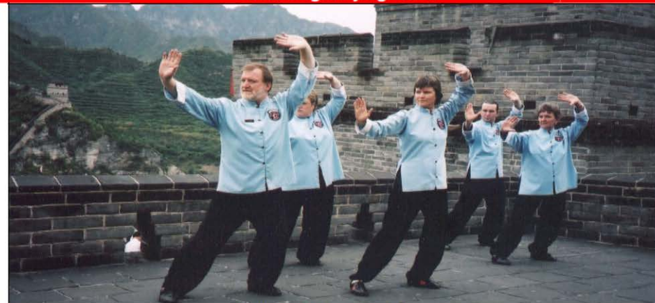
Chi Kung on the Great Wall of China