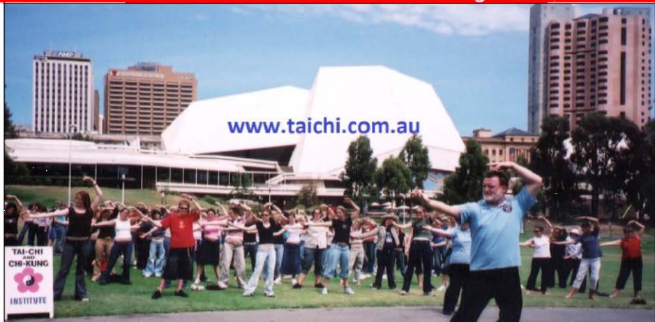
Tai Chi - Chi Kung in Adelaide