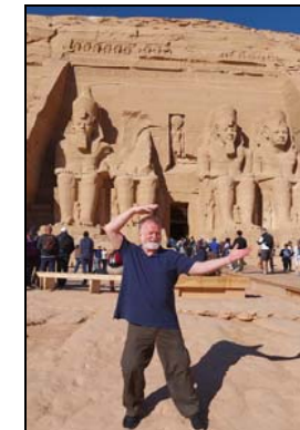
Chi Kung at Dendera & Abel Simbel Temples in Egypt December 2023

Where will you be practising these holidays? SA? Overseas?