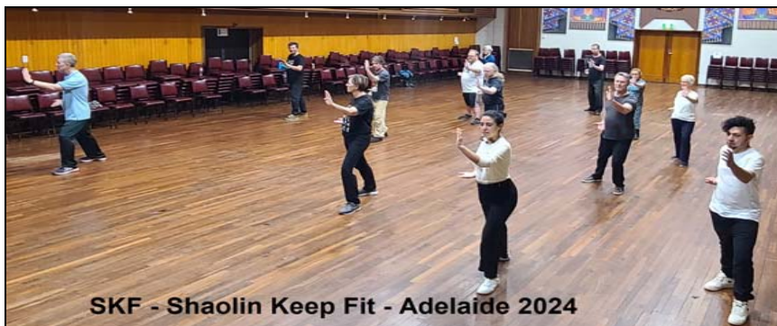
SKF - Shaolin Keep Fit - Adelaide 2024

Filmed in China 1998 Usb - $25 includes Mp4 video & book pdf