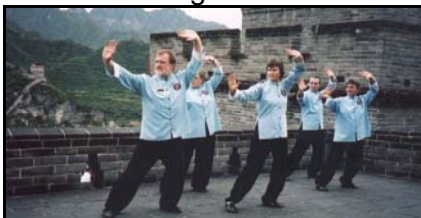
Chi Kung 2 nd Set on the Great Wall of China

Chi Kung 2 nd Set for Chi Kung students who have previously learned this set and want to revise or Chi Kung students who have completed the 1 st Chi Kung Shibashi set