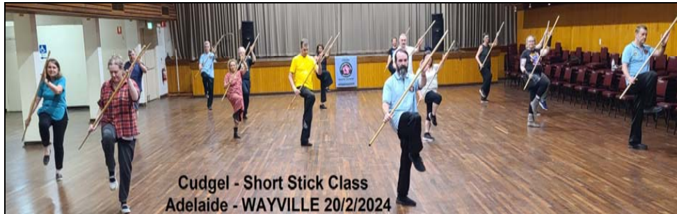
Cudgel - Short Stick Class Adelaide - WAYVILLE 20/2/2024

Filmed in China 1993 Usb - $25 includes Mp4 video & chart pdf