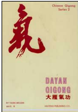
Official Textbook - $25

Adelaide - Wayville (Tues pm) & North Adelaide Fri (9.45am)