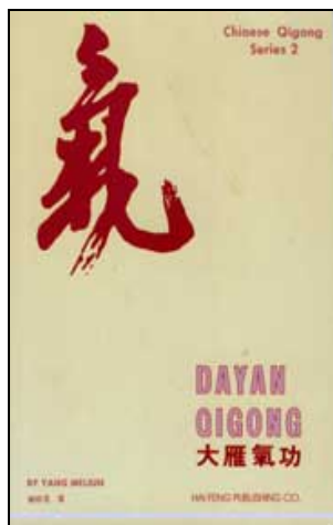
Textbook - $25

Adelaide - Wayville (Tues pm) & North Adelaide Fri (9.45am)