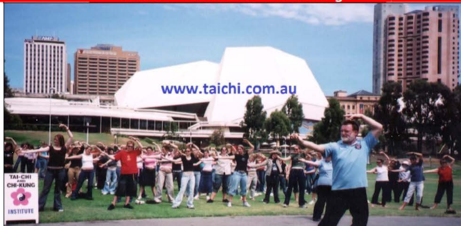
Tai Chi - Chi Kung in Adelaide