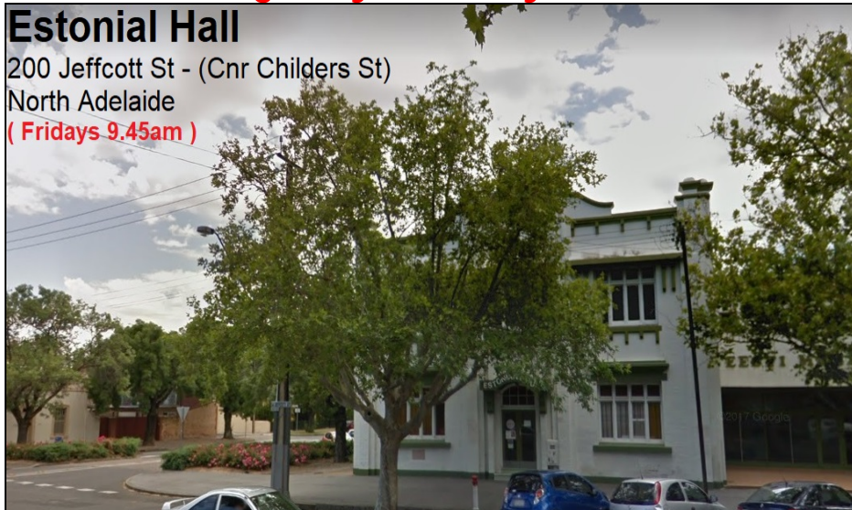
Estonian Hall 200 Jeffcott St - (Cnr Childers St) North Adelaide (Fridays 9.45am)