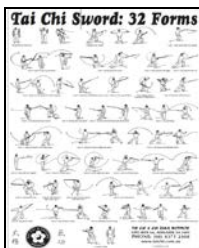
Chart & DVD available at class

This Sword set, 32 forms, has been taught in Adelaide since 1988 (30 years)