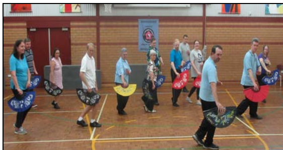
Adelaide: - Fan SKF class