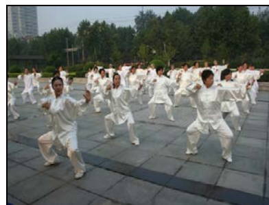
Ba Duan Jin