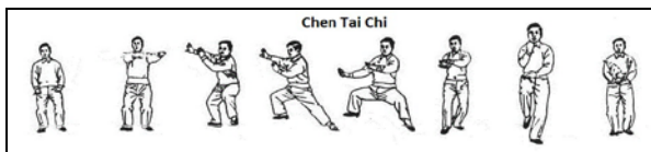
Chen Tai Chi & Kung Fu Fan sets finished this Term