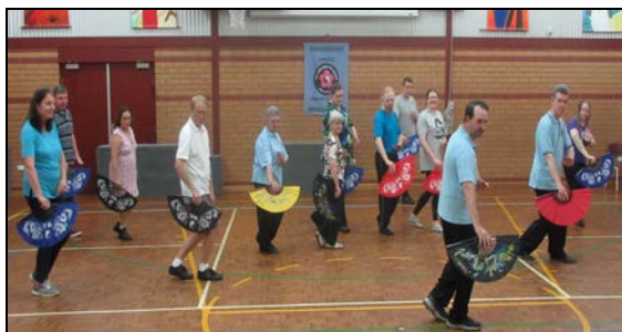
Adelaide: - Fan SKF class