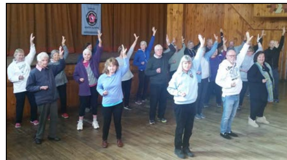
Dao Yin Diabetes Set at North Adelaide

Adelaide Tuesday 24 th July and North Adelaide Friday 27 th July at 9.30am.