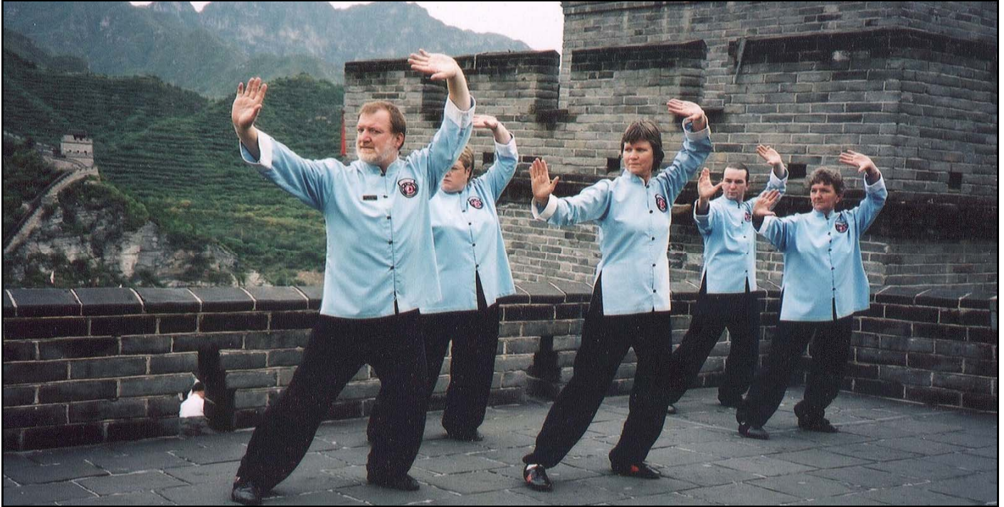
Chi Kung on the Great Wall of China